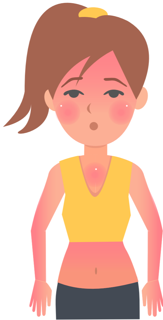
RED AND HOT SKIN