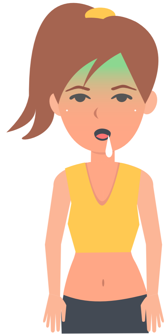
NAUSEA AND VOMITING